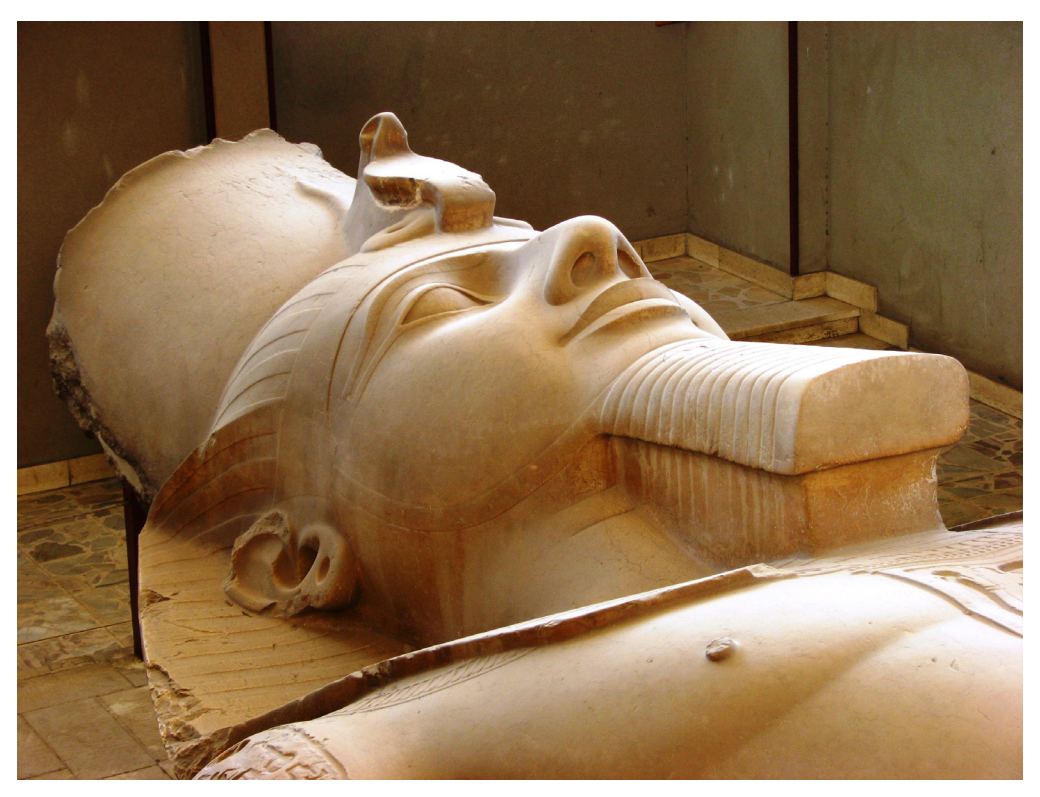
4. Ramesses II statue, Memphis Museum.