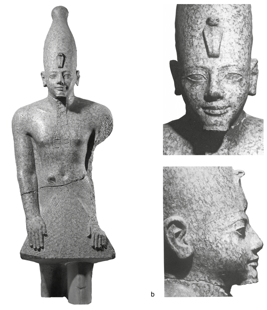
1a-b. Ramesses II statue, British Museum, inv. no. AES 61 (a. British Museum , © The British Museum; b. Vandersleyen 2012: 217, Fig. 6.2–3).