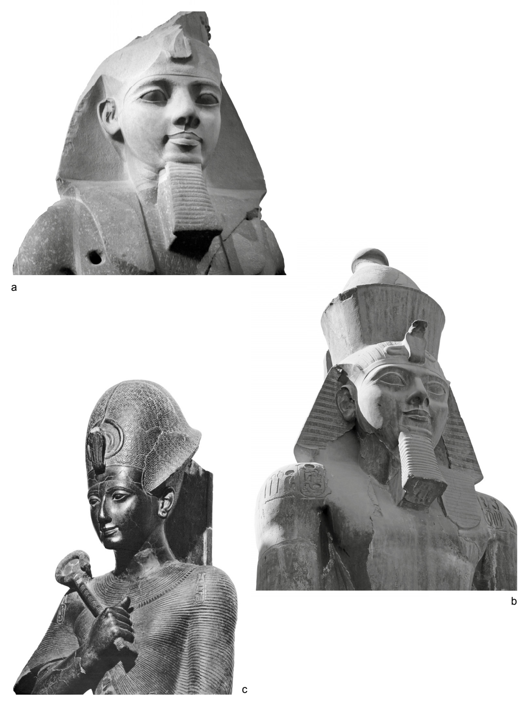
2. Ramesses II statues: a. British Museum, inv. no. EA 19; b. Luxor Temple; c. Turin Museum, inv. no. C. 1380 (a. British Museum , © The British Museum; b. Phot. M. Kassem; c. Scamuzzi 1966: Pl. VII).