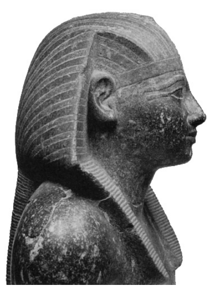
3. Amenhotep II statue, Egyptian Museum in Cairo, inv. no. CG 42073 (Legrain 1906: Pl. XLIII).

specific features characterizing kings of the post-Amarna Period and those of Ramesses II in particular.<sup>17</sup>