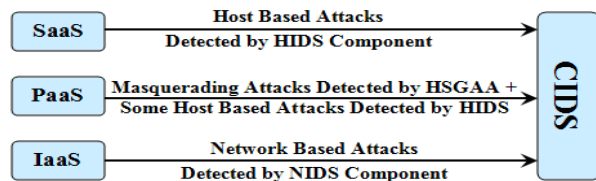
Figure.2: Attacks and services covered by CIDS.

CIDS is a defense strategy that satisfies the previous IDS requirements and deals with some attacks against SaaS, PaaS and IaaS clouds.