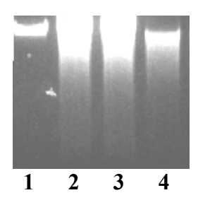
Fig.(7): Agarose gel electrophoretic pattern of DNA in control and treated . 1: control, 2: exposed to smoke for 5 min, 3: exposed to smoke for 10 min. and 4: exposed to smoke for 15 min.

Fig (7) shows the agarose gel electrophoretic pattern of DNA from blood in control and treated mice groups .DNA in control (group 1) mice vielded intact DNA. Smoke exposed (groups 2, 3 and 4) mice showed DNA fragmentations as evident by laddering pattern characteristic. DNA damage was also reported by Navasumrit et al. (2008), they found that temple worker when were exposed to incense smoke had a significant increase in DNA damage and strand breaks, and they found that 8-hydroxy-2-deoxyguanosine (8-OHdG) represents an important product of oxidative damage to DNA induced by the reaction of hydroxyl radicals with guanosine at the C<sub>8</sub> site in DNA. A significant correlations between DNA damage and exposure levels to benzene and PAHs suggested that increased DNA damage my be in part due to the genotoxic effects of compounds generated from incense burning (Chang et al., 2007). The high biological relevance of 8-OHDG is due to its ability to induce G-T transversion, which is amongst the most frequent somatic mutations found in human cancer (Chang et al., 2007).