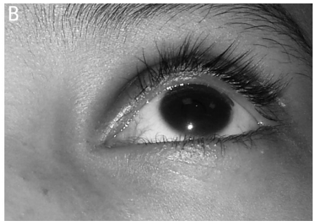
Figure 5 A close up photograph of the left eyelid of a 13-year-old female child demonstrating that the bare tarsus color "normalized" rapidly and the lid margin appears in a good position with lashes directed upwards 4wk after ALR compared to the preoperative photo.

by others, the dissection was performed only through the upper lid crease incision and down to the lid margin as the lid margin is usually distorted in UCE with no identifiable grey line<sup>[3-4,7-9,13-17]</sup>. This approach allows for more accurate and meticulous dissection especially at the lid margin without losing the tissue plane or inadvertently cutting through the tarsal plate. Dissection may continue beyond the lash follicles, peeling the entire anterior lid margin from the tarsus in cases of metaplastic lashes and keratinization. In addition, the upper lid crease incision allows the surgeon to address the associated lid problems with no need for extra incision<sup>[11-12]</sup>.